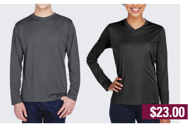
Team 365 Long Sleeve T-Shirt

100% moisture-wicking polyester. Women's fit is v-neck only.