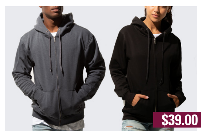
Unisex Everyday Fleece Zip-Up Hoodie 50% cotton, 50% polyester. Double-lined hood.

Imprint: Full-colour embroidery on left chest (~4x4"), OR three-colour screenprint on one location (left chest OR back OR one sleeve).