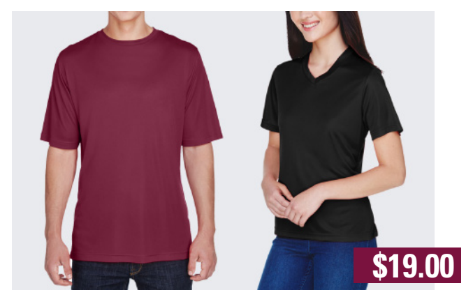
Team 365 Short Sleeve T-Shirt

100% moisture-wicking polyester. Women's fit is v-neck only.