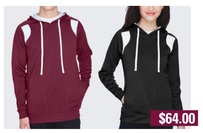
Elite Performance Pullover Hoodie

100% polyester. Tricot mesh lining in hood. Unisex or women's.