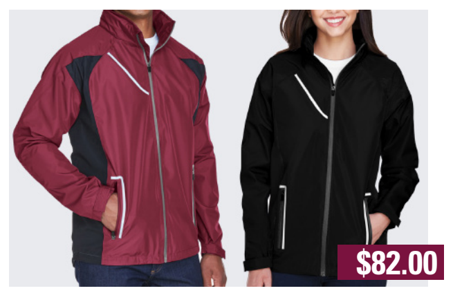
Team 365 Dominator Jacket

100% polyester. Waterproof & breathable. Rollaway hood. Unisex or women's.