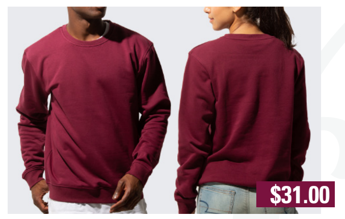
Unisex Heavy Blend Fleece Crewneck 50% cotton, 50% polyester fleece.

Imprint: Full-colour embroidery on left chest (~4x4"), OR three-colour screenprint on one location (left chest OR back OR one sleeve).