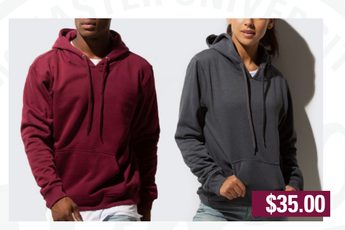
Unisex Everyday Fleece Pullover Hoodie 50% cotton, 50% polyester. Double-lined hood.

Imprint: Full-colour embroidery on left chest (~4x4"), OR three-colour screenprint on one location (left chest OR back OR one sleeve).